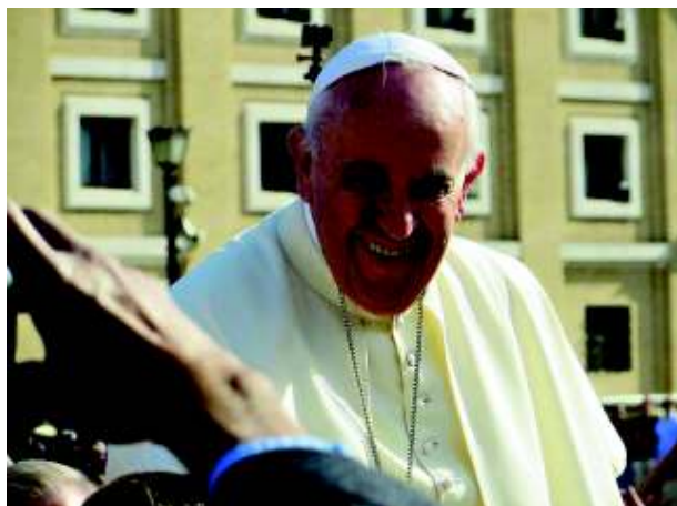
Pope Francis 1936-2025