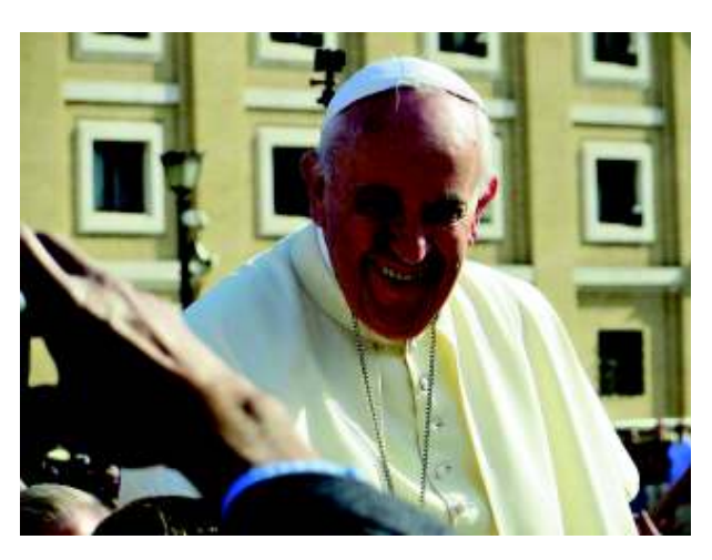
Pope Francis' Prayer Intentions for March

Vatican City, 1 March 2025 (VIS) – The Holy Father's prayer intention for March – For families in crisis "Let us pray that broken families might discover the cure for their wounds through forgiveness, rediscovering each other's gifts, even in their differences." Let us all continue daily prayer for the health of Pope Francis.