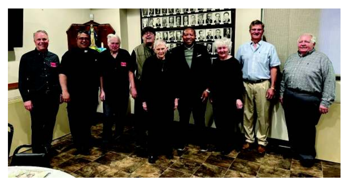
Clergy Appreciation Banquet

Council 722 recently held a Clergy Appreciation Banquet. Area Priests, Sisters, and Deacons were welcome to share a meal and the story of what inspired them to follow a religious vocation.