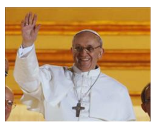
Pope Francis' Prayer Intentions for September

Vatican City, 1 September 2023 (VIS) – The Holy Father's prayer intention for September – For people living on the margins "We pray for those persons living on the margins of society, in inhumane life conditions; may they not be overlooked by institutions and never considered of lesser importance."