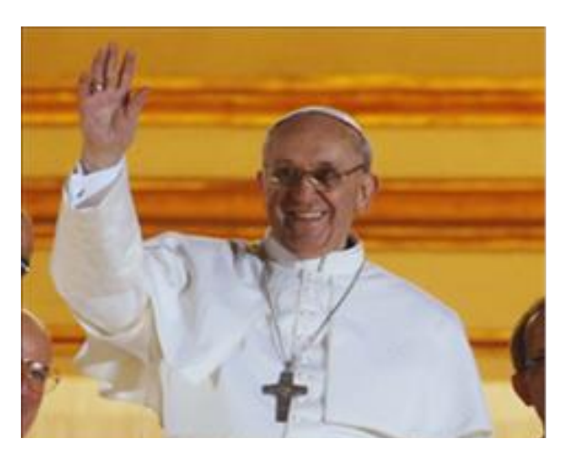
Pope Francis' Prayer Intentions for January

Vatican City, 1 January 2023 (VIS) – The Holy Father's prayer intention for January – For Educators "We pray that educators may be credible witnesses, teaching fraternity rather than competition and helping the youngest and most vulnerable above all."