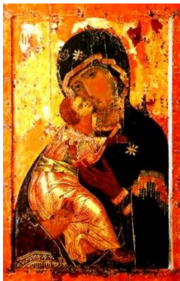
Our Lady of Kyiv, Pray for Ukraine